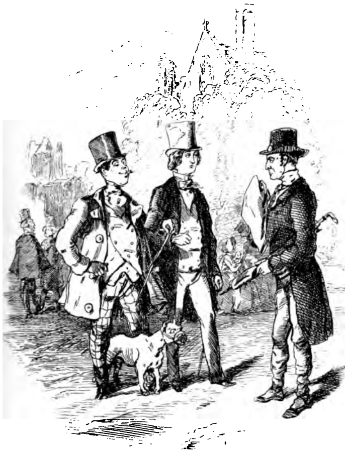
YOUTH BETWEEN PLEASURE AND DUTY